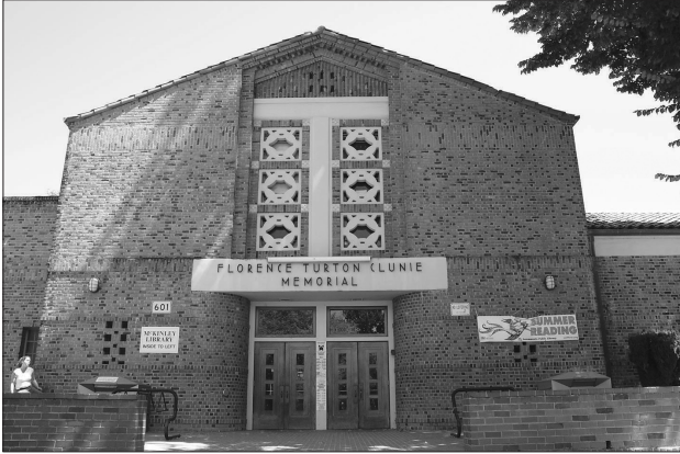
High Resolution Photo As Shown Above Prints Very Well