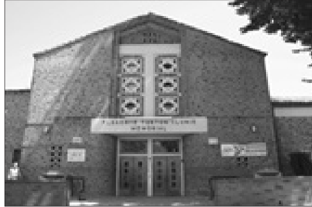
Low Resolution Photo As Shown Above Prints Poorly