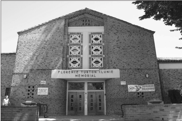
High Resolution Photo As Shown Above Prints Very Well