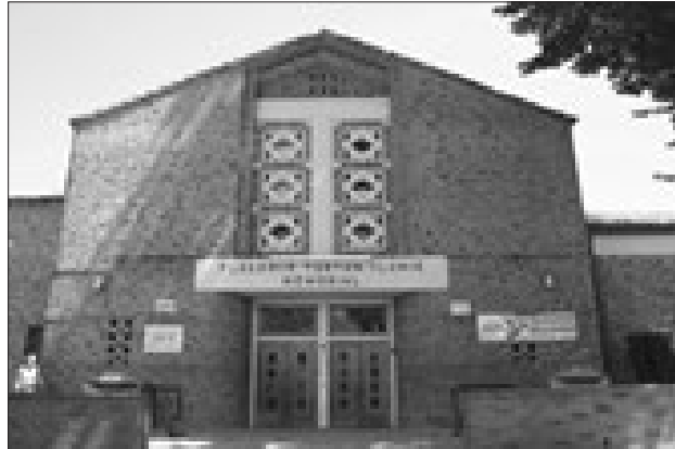
Low Resolution Photo As Shown Above Prints Poorly