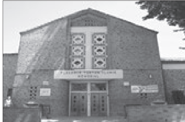
Low Resolution Photo As Shown Above Prints Poorly