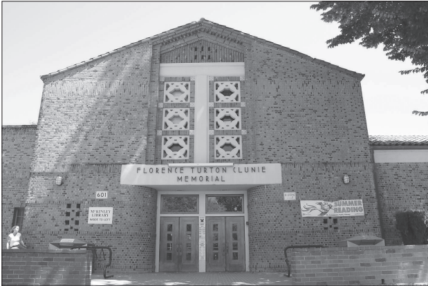
High Resolution Photo As Shown Above Prints Very Well